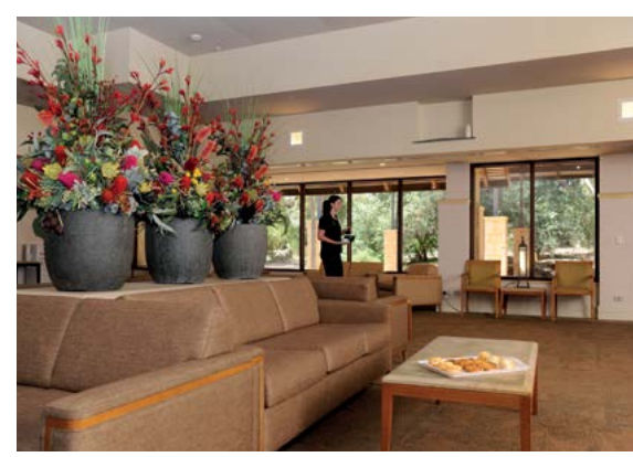
East Condolence Lounge

Catering within the condolence lounges can be coordinated through your Funeral Director. For those families who are not planning to utilise the condolence lounge, our on-site caterers are able to offer a take-home food service should a gathering be scheduled to occur at an alternate location. This service can also be arranged through your Funeral Director.