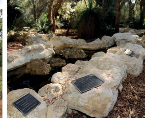
Memorial rocks at Santalum Court