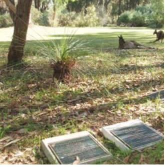
Premium Ground Niches in Magpie Loop