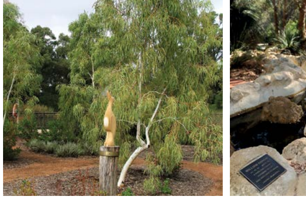
Exclusive Ground Niches available on Sir Thomas Meagher Island

For those not wishing to establish a memorial within the grounds, a selection of decorative urns and items for the storage of cremated remains is available and can be viewed at our Pinnaroo office.