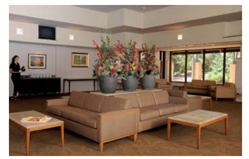
East Condolence Lounge

Livestreaming is available in both chapels. Please consult with the Funeral Director to make arrangements.