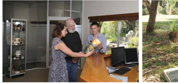
A wide variety of urns are available for viewing