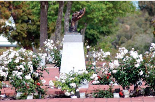
Children's Memorial Garden

Natural Burials at Fremantle are located within an elevated grove that overlooks the cemetery's splendid bush land gully. Bordered by traditional burial locations, this unique pocket of land will be progressively vegetated with natural bush land plant species as plots are utilised.