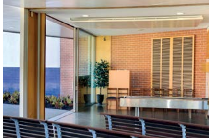
Outdoor Committal Area

This outdoor area is a popular choice during the warmer months and provides an informal alternative to the traditional chapel environment.