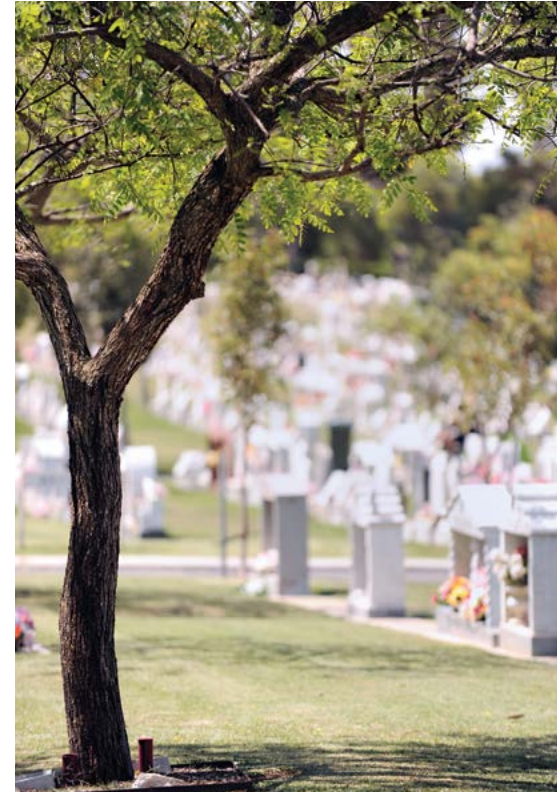
Lawn area graves