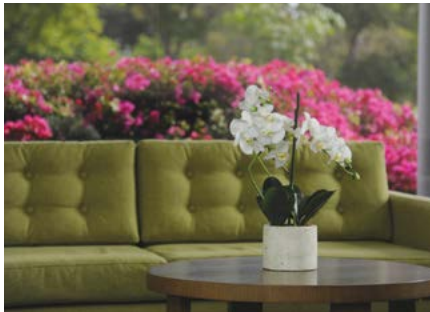
East Condolence Lounge

Both indoor chapels at Fremantle Cemetery are air conditioned.